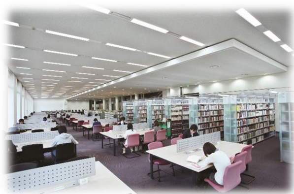
↑ Mandai Memorial Library @ Sagamihara Campus

* Overseas offices in Sydney (Australia), L.A.(U.S.A.), Beijing (China), Bangkok (Thailand), Taipei (Taiwan)