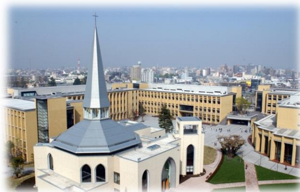
↑ Sagamihara Campus